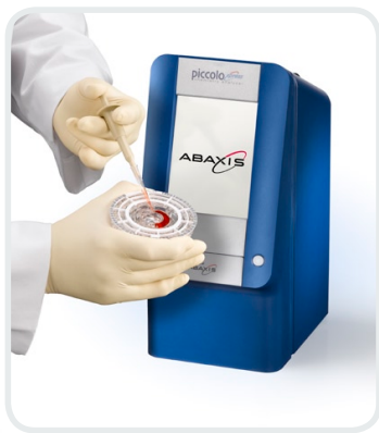
Step 1: Add sample