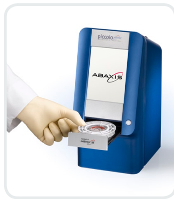
Step 2: Insert disc