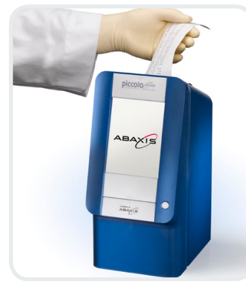
Step 3: Read results